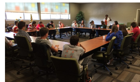
Youth Leadership Knox County

It is the policy of Pace Community Action Agency, Inc. to comply with all State & Federal regulations prohibiting discrimination on the basis of race, sex, age, color, religion, national origin, disability, veteran status, or any other protected category within our programs, employment practices, and access to facilities.